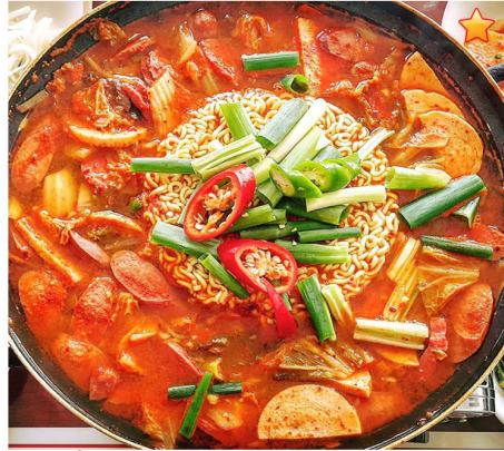
★ BUDAE JEONGOL 부대 전골 ASSORTED SAUSAGES & SPICY RAMYUN HOT-POT ... M 145 / L 175