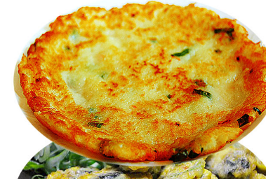
★ GAMJA JEON (V) 감자전 POTATO FRIED PAN CAKE ... 40