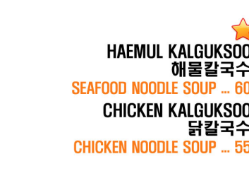
★ HAEMUL KALGUKSU 해물칼국수 SEAFOOD NOODLE SOUP ... 60 CHICKEN KALGUKSU 닭칼국수 CHICKEN NOODLE SOUP ... 55