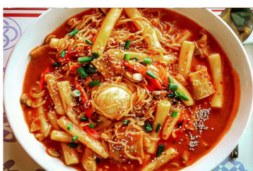
★ RABOKKI 라볶이 SPICY RICE CAKE & NOODLES ... 50 🔥