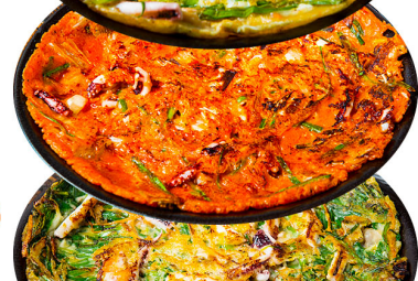
BEST HEAMUL KIMCHJEON 🌶️ 해물김치전 SEAFOOD & KIMCHI FRIED PAN CAKE ... 55