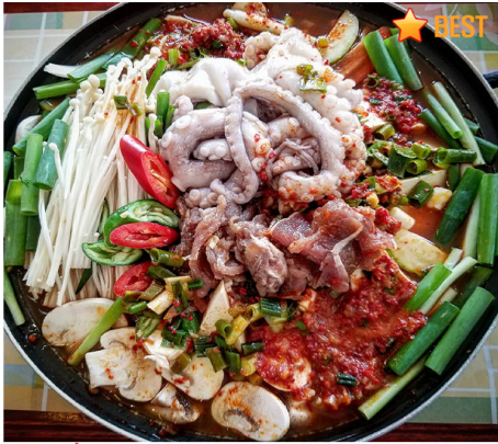
★ BULNAK JEONGOL 불낙 전골 BULGOGI BEEF & OCTOPUS HOT-POT ... M 145 / L 175