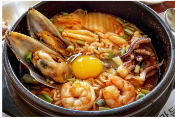
★ HEAMUL RAMYON 해물 라면 SEAFOOD RAMYON BOWL ... 55 BEEF RAMYON 소고기 라면 ... 55 KIMCHI RAMYON 김치 라면 ... 50 🔥🔥