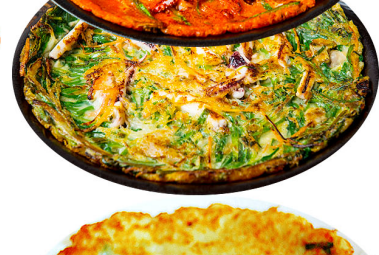
HEAMUL BUCHU 해물부추전 SEAFOOD & CHIVE FRIED PAN CAKE ... 55