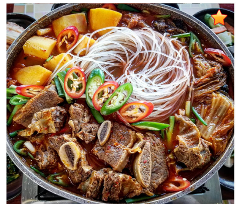
★ MUKEYUNJI GALBIJIM 목은지 갈비탕 (BEEF-RIP GAMJATANG 소갈비 감자탕) BRAISED KIMCHI & SHORT RIBS ... M 150 / L 180