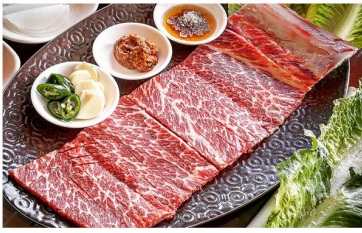
★ BEST SAENG GALBI (PRIME GRADE) 생갈비 UNSEASONED SHORT RIB ..... 95