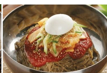
★ BIBIMNAENGMYEON 비빔냉면 SPICY COLD NOODLES ... 60 🔥🔥