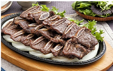
★ BEST LA GALBI (PRIME GRADE) LA갈비 SEASONED SHORT BEEF RIB ..... 85