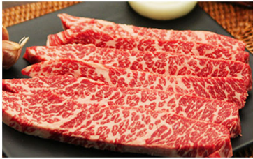
★ BEST GALBISAL (PRIME GRADE) 갈비살 UNSEASONED BONELESS SHORT RIB ..... 95