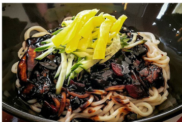
★ BEST JJAJANGMYEON 짜장면 NOODLES with BLACK SOYBEAN SAUCE ... 55 JUMBO SEAFOOD JJAJANGMYEON 해물 썬반짜장면 JUMBO SIZED SEAFOOD NOODLES with BLACK SOYBEAN SAUCE ... 110