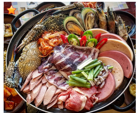
★ HEAMUL BUDAE JUNGOL 해물부대전골 SEAFOOD & SAUSAGES HOTPOT... M 155 / L 185