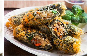
★ GIM MALI (8 pieces) 김말이 튀김 FRIED SEAWEED ROLLS with NOODLE & VEGETABLES ... 45