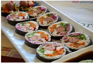
★ BULGOGI GIMBAB 불고기 김밥 OPTION : BEEF / SAUSAGE / VEG ... 45 TUNA MAYONNAISE / CHEESE ... 50