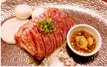
★ BEST YANGNEUM GALBI (PRIME GRADE) 양념갈비 (PRIME GRADE) SEASONED SHORT RIB ..... 85