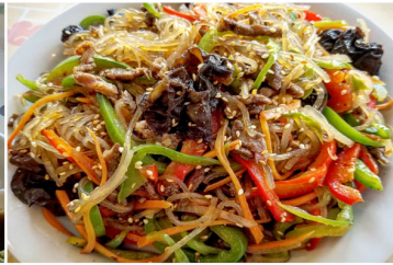
★ BEEF JAB CHE 잡채 GLASS NOODLES with SAUTEED MEAT & VEGETABLES ... 55 (Vegetarian Option Available)