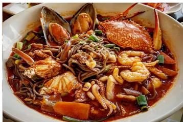
★ CRAB JJAM BBONG 꽃게 짬뽕 HOT SPICY NOODLES CRAB, MEAT & SEAFOOD ... 65 🔥🔥