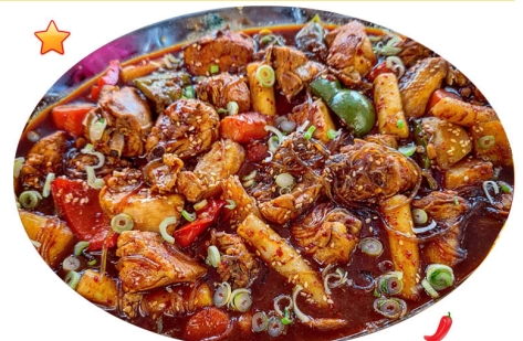
★ GALBIJIM or KKORIJIM 갈비찜 / 꼬리찜 BRAISED SHORT RIBS or OX-TAIL ... 130