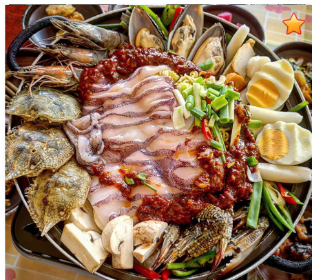
★ TONGGOJINGEO TTEOKBOKKI 통오징어 떡볶이 WHOLE SQUID & SPICY RICE CAKE RAMYUN HOT-POT ... M 130 / L 160