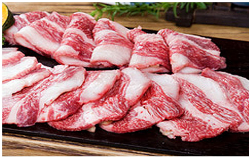
★ BEST CHADOLBAKI (PRIME GRADE) 차돌박이 UNSEASONED BEEF BRISKET ..... 68