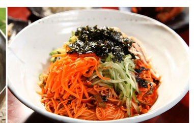
BIBIM MEMIL GUKSU 비빔메밀국수 SPICY COLD BUCKWHEAT NOODLES ... 55 (Vegetarian Option Available) 🔥🔥