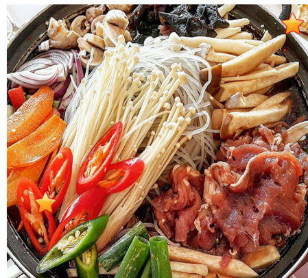
★ BEOSEOT BULGOGI JEONGOL 버섯 불고기 전골 MUSHROOM & BULGOGI BEEF HOT-POT ... M 145 / L 175