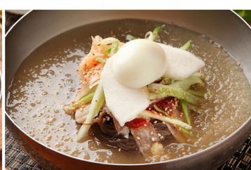
★ MULNAENGMYEON 물냉면 COLD BROTH NOODLES ... 60