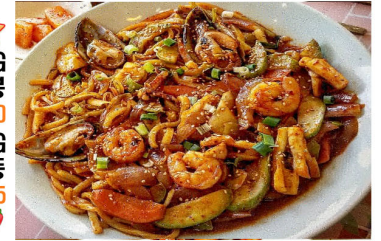
BEST ★ JJAM BBONG 짬뽕 HOT SPICY NOODLES MEAT & SEAFOOD ... 60 🔥🔥