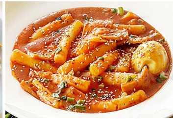
★ DDEUK BOKKI 떡볶이 SPICY RICE CAKE ... 45 (Vegetarian Option Available)