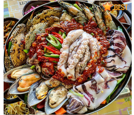
★ HEAMUL JEONGOL 해물 전골 MIXED SEAFOOD HOT-POT ... M 150 / L 180