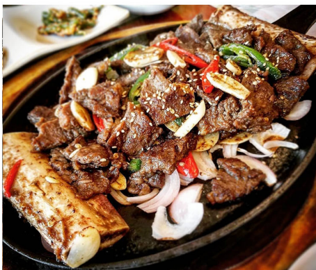
★ YANGNYUM GALBI with Chili & Garlic for Two 양념갈비 고추마늘구이 2인분 SEASONED RIB with Chili & Garlic 2portion ... 170

※라면사리 추가 + ADDITIONAL RAMYON NOODLE .... 10