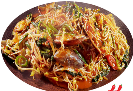
★ DONGTAEJIM or HONGHABJIM 동태찜 / 홍합찜 BRAISED POLLACK or MUSSEL ...130