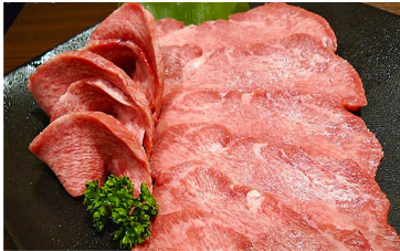
★ WOOSULGUI (PRIME GRADE) 우설구이 UNSEASONED BEEF TONGUE ..... 68