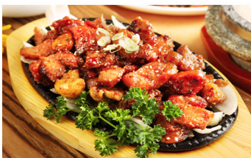
★ BEST DAKGALBI 🌶️ 닭갈비 SEASONED BONELESS CHICKEN .. 65