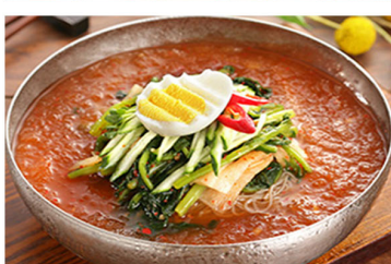
YEOLMU GUKSU 열무국수 COLD NOODLES in YOUNG RADISH KIMCHI SOUP ... 55