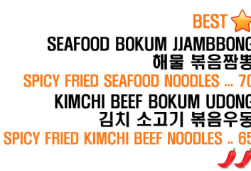
BEST ★ SEAFOOD BOKUM JJAMBBONG 해물 볶음짬뽕 SPICY FRIED SEAFOOD NOODLES ... 70 KIMCHI BEEF BOKUM UDONG 김치 소고기 볶음우동 SPICY FRIED KIMCHI BEEF NOODLES ... 65 🔥🔥