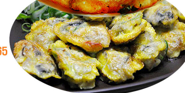
SAWOO JEON 새우전 SHRIMP FRIED PAN CAKE ... 55