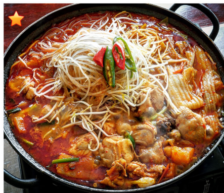
★ MUKEYUNJI DAKDORITANG 목은지 닭볶음탕 BRAISED SPICY KIMCHI & CHICKEN ... 130