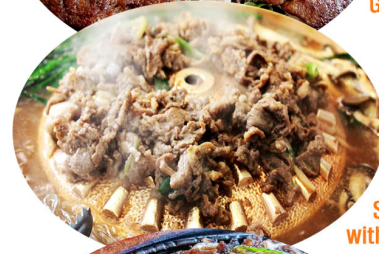
★ BEST JUMBON BULGOGI with GRILL-PAN 불판 불고기 SEASONED BEEF, VEG & GLASS NOODLE with STEEL-PAN ... 85