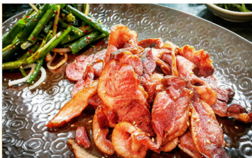
SMOKED DUCK 훈제오리구이 SMOKED DUCK & GREEN ONION SALAD ... 85