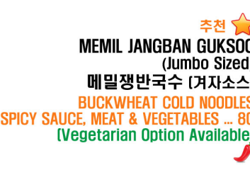
추천 ★ MEMIL JAMBAN GUKSU (Jumbo Sized) 메밀쟁반국수 (겨자소스) BUCKWHEAT COLD NOODLES with SPICY SAUCE, MEAT & VEGETABLES ... 80 (Vegetarian Option Available) 🔥