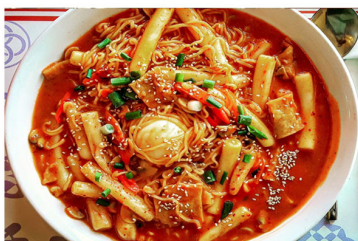
★ RABOKKI 라볶이 SPICY RICE CAKE & NOODLES ... 50 🌶️