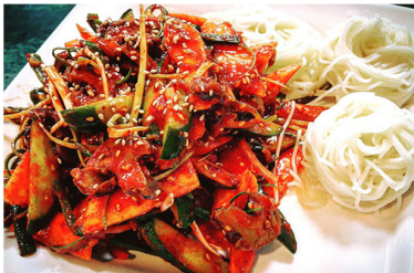
★ GOLBAENGI SOMYON 골뱅이 소면 SPICY SEA SNAILS SALAD with NOODLES ... 70