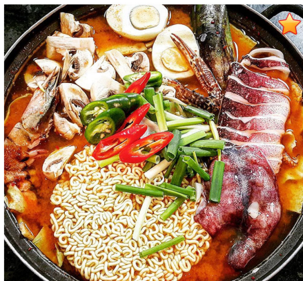
★ TONGOJINGEO TTEOKBOKKI 통오징어 떡볶이 WHOLE SQUID & SPICY RICE CAKE RAMYUN HOT-POT ... M 125 / L 155