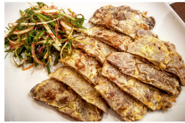
★ SOGOGI YUKJEON 소고기 육전과 파무침 BEEF FRIED PAN-CAKE & GREEN ONION SALAD ... 60