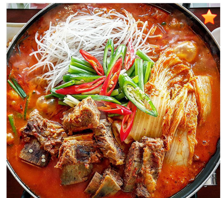
★ MUKEUNJI GALBIJIM 목은지 갈비탕 (GAMJATANG 소갈비 감자탕) BRAISED KIMCHI & SHORT RIBS ... M 150 / L 180