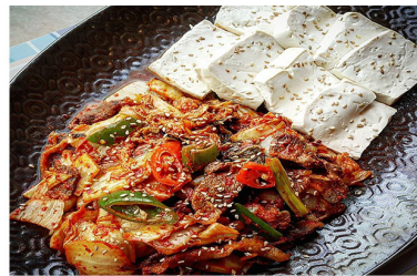
★ DUBU KIMCHI 두부김치 TOFU WITH STIR-FRIED KIMCHI ... 65 (Vegetarian Option Available)