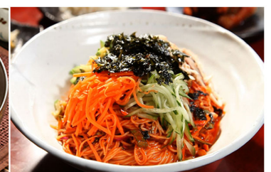
추천 ★ MEMIL JANGBAN GUKSU (Jumbo Sized) 메밀쟁반국수 (겨자소스) BUCKWHEAT COLD NOODLES with SPICY SAUCE, MEAT & VEGETABLES ... 80 (Vegetarian Option Available) 🌶️