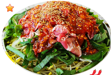
★ KONGBUL JJIM 차돌박이 콩bul찜 BEAN SPROUT & BEEF BRISKET ... M 145 / L 175