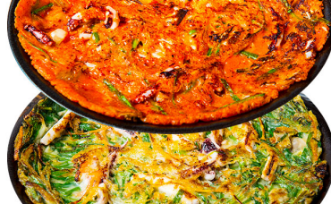
BEST HEAMUL KIMCHIJEON 🌶️ 해물김치전 SEAFOOD & KIMCHI FRIED PAN CAKE ... 55