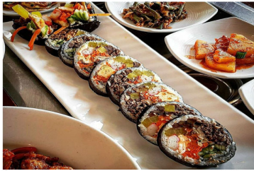
★ BULGOGI GIM BAB 불고기 김밥 DRIED SEAWEED RICE ROLLS with MEAT & VEGETABLES ... 45