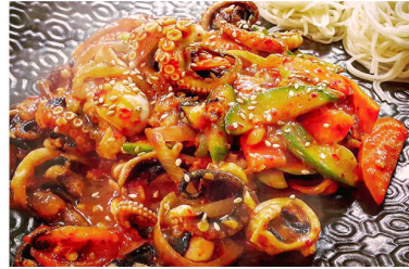
★ BEST NAKJI BOKKEUM 낙지볶음 소면 STIR-FRIED SPICY OCTOPUS with NOODLE ... 75 OJINGEO BOKKEUM 오징어볶음 STIR-FRIED SPICY SQUID ... 68