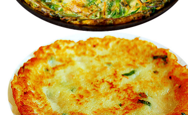
HEAMUL BUCHU 해물부추전 SEAFOOD & CHIVE FRIED PAN CAKE ... 55