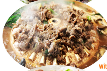
★ BEST JUMBON BULGOGI with GRILL-PAN 불판 불고기 SEASONED BEEF, VEG & GLASS NOODLE with STEEL-PAN ... 85