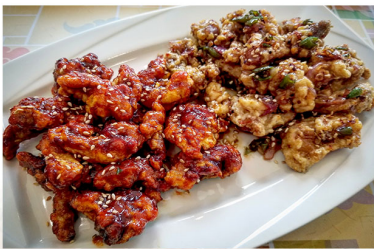
★ HALF HALF CHICKEN 반반 치킨 / 새우 / 생선 SPICY & SWEET FRIED CHICKEN & YANGNUM CHICKEN OPTION: CHICKEN ... 60 PRAWN / FISH ... 65