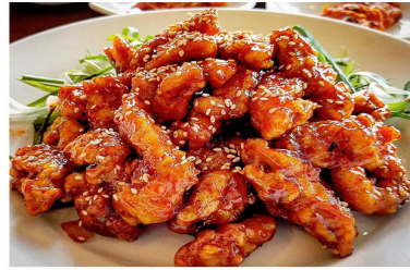
★ BEST BONELESS YANGNUM CHICKEN 순살양념 치킨 / 새우 / 생선 / 버섯 SPICY DEEP-FRIED CHICKEN OPTION: CHICKEN ... 55 MUSHROOM / PRAWN / FISH ... 60