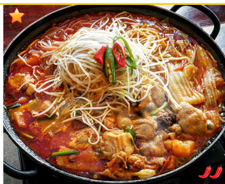
★ MUKEUNJI DAKDORITANG 목은지닭도리탕 BRAISED SPICY KIMCHI & CHICKEN ... 130