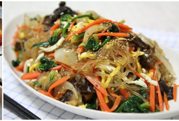
★ BEEF JAB CHE 잡채 GLASS NOODLES with SAUTEED MEAT & VEGETABLES ... 55 (Vegetarian Option Available)