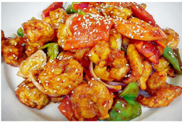
★ BEST MAKUM SAEWOO GANGJUNG 매콤 채소 새우강정 DEEP-FRIED SPICY SHRIMP & VEG ... 68