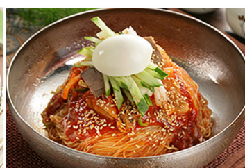
★ BIBIMNAENGMYEON 🌶️🌶️ 비빔냉면 SPICY COLD NOODLES ... 60