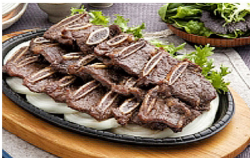
★ BEST LA GALBI (PRIME GRADE) LA갈비 SEASONED SHORT BEEF RIB ..... 85