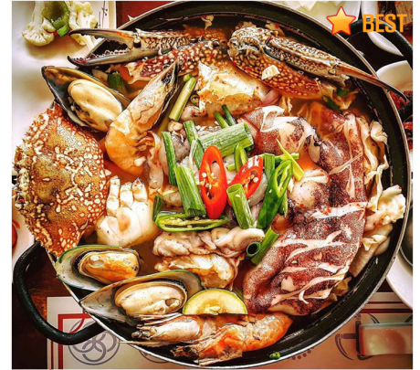
★ HEAMUL JEONGOL 해물 전골 MIXED SEAFOOD HOT-POT ... M 150 / L 180