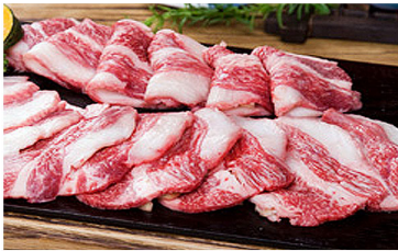
★ BEST CHADOLBAKI (PRIME GRADE) 차돌박이 UNSEASONED BEEF BRISKET ..... 68