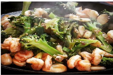
★ SAEWOO BROCCOLI BOKEUM 새우브로콜리 볶음 PAN-FRIED SHRIMP & BROCCOLI ... 65 MUSHROOM BROCCOLI BOKEUM 버섯 브로콜리 볶음 (Vegetarian) PAN-FRIED MUSHROOM & BROCCOLI ... 65