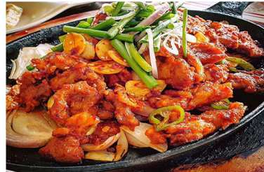
★ BEST DAKGALBI BUSUTMANUL BOKEUM or SHRIMP BUSUTMANUL BOKEUM 닭갈비 버섯마늘 볶음 / 새우 버섯마늘 볶음 SPICY BONELESS CHICKEN with MUSHROOM & GARLIC ... 65 PRAWN ... 70