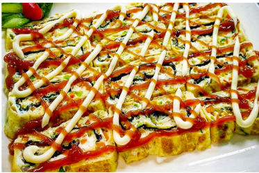
GYERAN MALI 계란말이 VEGETABLE EGG ROLLS KETCHUP & MAYONNAISE ... 45