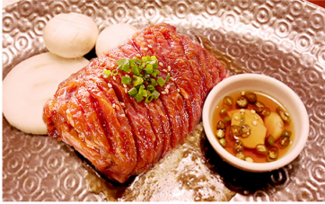
★ BEST YANGNEUM GALBI 양념갈비 (PRIME GRADE) SEASONED SHORT RIB ..... 85