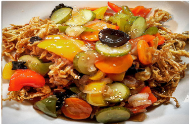
★ TANG SOOYUK 탕수육 닭고기 / 소고기 / 생선 / 버섯 / 새우 SWEET & SOUR DEEP-FRIED BEEF OPTION: BEEF / CHICKEN ... 60 PRAWN / FISH ... 65 FRIED MUSHROOM (Vegetarian) ... 65