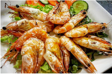
SALT SAEWOO GUI 새우소금구이 SALT GRILLED SHRIMP ... 65