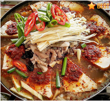
★ BULNAK JEONGOL 불낙 전골 BULGOGI BEEF & OCTOPUS HOT-POT ... M 145 / L 175