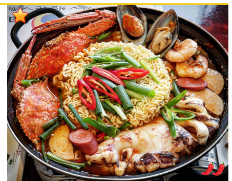
★ HEAMUL BUDAE JUNGOL 해물부대전골 SEAFOOD & SAUSAGES HOTPOT... M 150 / L 180