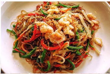
★ BEST SEAFOOD JAB CHE 해물잡채 GLASS NOODLES with SAUTEED SEAFOOD & VEGETABLES ... 60 (Vegetarian Option Available)