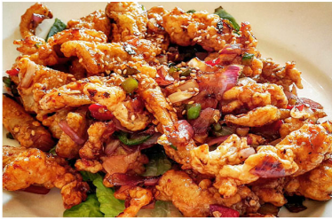
★ BEST GGANPUNGGI CRISPY CHICKEN 깡뽕기 치킨 / 새우 / 생선 / 오징어 SPICY & SWEET CRISPY-FRIED CHICKEN OPTION: CHICKEN ... 55 PRAWN / FISH / SQUID ... 60 치킨 / 오징어 깡뽕기 추천