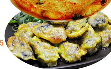
★ GAMJA JEON (V) 감자전 POTATO FRIED PAN CAKE ... 40