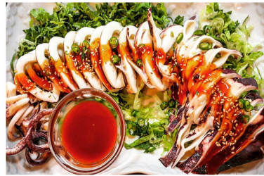
★ OJINGEO SOOKHOE 오징어 숙회 BOILED SQUID SLICE & SPICY SAUCE ... 55