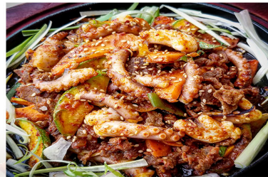
★ BULNAK BOKEUM 불낙 볶음 (불고기 낙지 볶음) STIR-FRIED SPICY BULGOGI BEEF & OCTOPUS ... 75