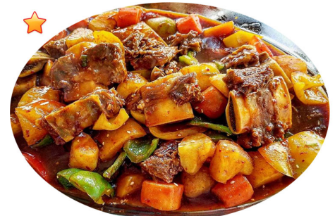
★ GALBIJIM or KKORIJJIM 갈비찜 / 꼬리찜 BRAISED SHORT RIBS or OX-TAIL ... 130