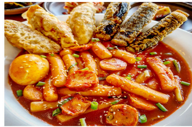
★ BEST TTUCKBOKKI with Fried Set 떡볶이와 만두 김말이 튀김 SPICY RICE CAKE with Deep Fried DUMPLING & GIMMALI SET ... 65