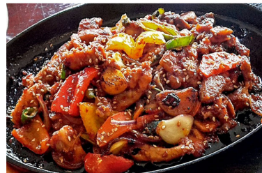
★ BEST TERIYAKI DAKGALBI BOKEUM TERIYAKI SHRIMP BOKEUM 데리야끼 닭갈비 마늘 볶음 / 데리야끼 새우 마늘 볶음 TERIYAKI BONELESS CHICKEN with GARLIC & VEG ... 65 PRAWN ... 70