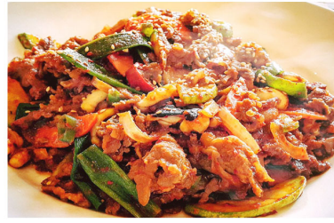
★ BEST JEYUK BOKKEUM 제육볶음 STIR-FRIED SPICY MEAT ... 68 OSAM BULGOGI 오삼불고기 STIR-FRIED SPICY SQUID & MEAT ... 68 순대볶음 ... 68