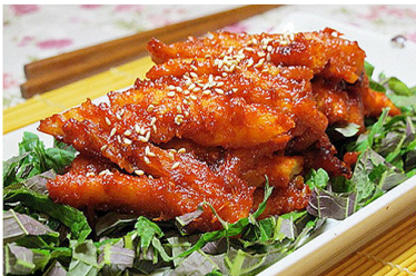
★ For Korean BITTER ROOT DEODEOK GUI 더덕 구이 GILLED SPICY ROOT of DEODEOK (HEALTHY PLANT ROOT) ... 65