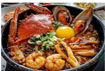
★ CRAB HEAMUL RAMYON 꽃게 해물라면 CRAB & SEAFOOD RAMYON BOWL ... 60 CRAB BEEF RAMYON 꽃게 소고기라면 CRAB & BEEF RAMYON BOWL ... 60