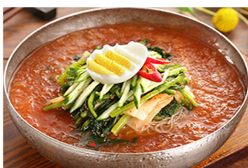
★ YEOLMU GUKSU 열무국수 🌶️ COLD NOODLES in YOUNG RADISH KIMCHI SOUP ... 55