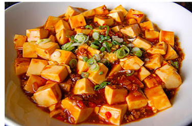
★ MAPA TOFU 마파두부 SPICY MAPA SAUCE TOFU & LITTLE MEAT ... 45 (Vegetarian Option Available)