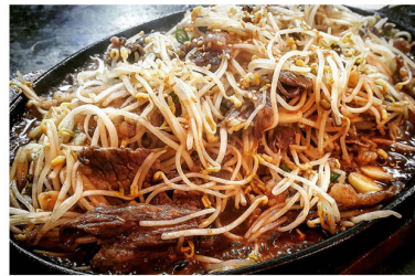
★ BEST CHADOLSUKJU BOKKEUM 차돌숙주 볶음 STIR-FRIED BEEF BRISKET & BEAN SPROUTS ... 70