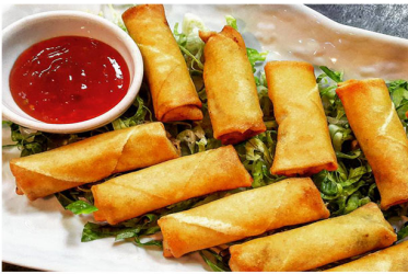
SPRING ROLLS (8 pieces) 스프링롤 VEGETABLE SPRING ROLLS & CHILI SAUCE ... 45