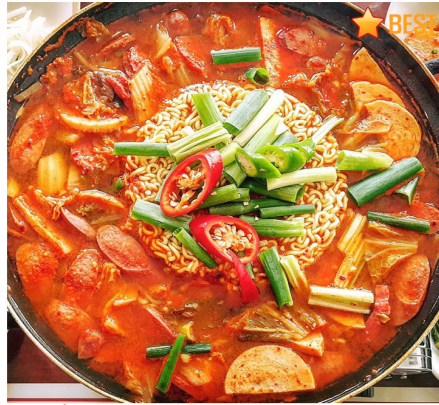
★ BUDAE JEONGOL 부대 전골 VARIOUS SAUSAGES & SPICY RAMYUN HOT-POT ... M 145 / L 175