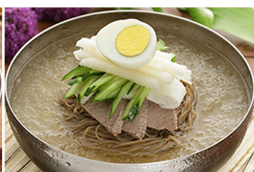
★ MULNAENGMYEON 물냉면 COLD BROTH NOODLES ... 60