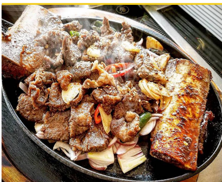
★ YANGNYUM GALBI with Chili & Garlic for Two 양념갈비 고추마늘구이 2인분 SEASONED RIB with Chili & Garlic 2portion ... 170

※라면사리 추가 + ADDITIONAL RAMYUN NOODLE .... 10