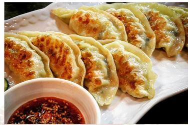
FRIED TWIGIM MANDOO 튀김만두 FRIED DUMPLINGS ... 45 STEAMED JJIN MANDOO 찜만두 STEAMED DUMPLINGS ... 45

※ 공기밥+국 + ADDITIONAL STEAMED RICE & SOUP of the day ... 15