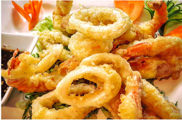
★ SAEWOO OJINGEO TUWIGIM 새우오징어 튀김 DEEP-FRIED SHRIMP & SQUID with SOY SAUCE ... 68