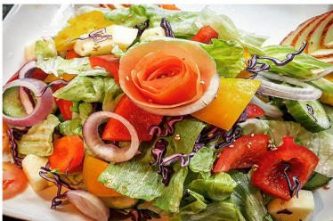
★ VEGETABLE SALAD 야채 샐러드 BALSAMIC OLIVE DRESSING SALAD ... 45 (Vegetarian)