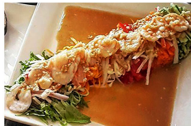
★ SAEWOO NANGCHE 새우냉채 SHRIMP & VEGETABLE SALAD with MUSTARD SAUCE ... 65