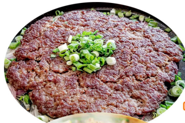
★ TTEOKGALBI (Seasoned Beef Patty) 떡갈비 GRILLED PRIME BEEF PATTY ..... 85