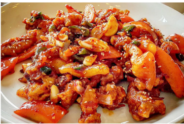
★ BEST MEAKOM DAKGANGJUNG 매콤 닭강정 DEEP-FRIED SPICY CHICKEN & VEGETABLES ... 65